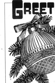
May peace, love and contentment decorate your holiday as you share in the festive happenings with those you hold most dear.

Students in introductory geography classes in Kentucky's state universities are seriously lacking in basic geographic information. The study found that 30 percent of the students surveyed could not identify Louisville and 20 percent could not identify Lexington. Students in introductory geography classes in Kentucky's state universities are seriously lacking in basic geographic information. The study found that 30 percent of the students surveyed could not identify Louisville and 20 percent could not identify Lexington.