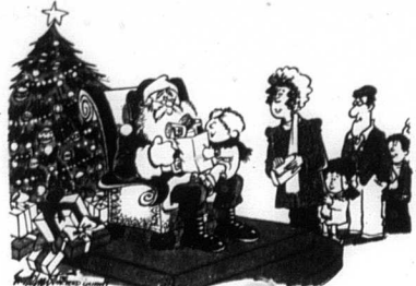
"WHEN YOU GET TO ETHIOPIA, WOULD YOU GIVE THIS FOOD TO A HUNGRY PEOPLE?"