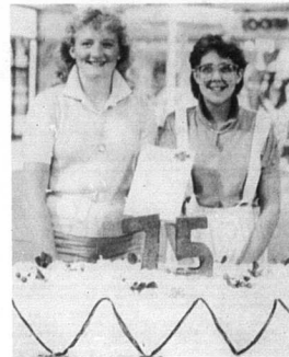
A happy occasion