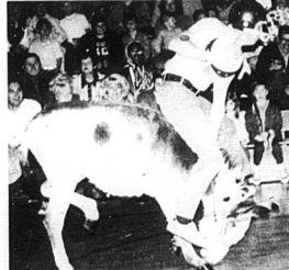
Donkey ball doubleheader

The Frymans were the first breeders of Egyptian Arabian horses in Kentucky.