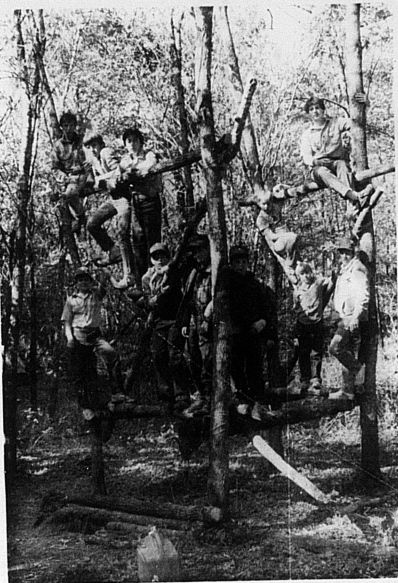
Scouting the countryside

Warm, fall weekend weather proved an ideal time for Boy Scouts of Troop No. 59 to explore the great outdoors. Posing on timber they used to build a slice-completed tower at Camp Bartterfoot, near Bartterville, are top row