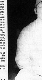
Makes triple play

Pork and poultry paced the price increases in your area.