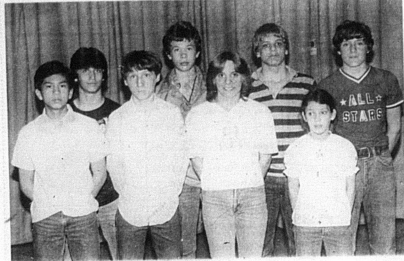
These students were the top eight in competition for the President's Physical Fitness Award at Nicholas County Elementary School. Each scored in the top 10 percent nationwide for their age group.