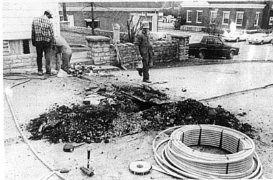
Gas line work almost finished