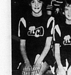
7th and 8th grade cheerleaders

Nicholas County Little League baseball tryouts will be held at the elementary school gym Sunday, March 6, at 12 p.m. The tryouts are for both boys and girls ages 9 to 12. To be acceptable, you must not have your 12th birthday until Aug. 1 or afterwards.