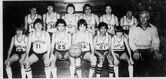
7th graders finish 19-2