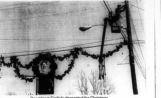
Downtown Carlisle decorated for Christmas