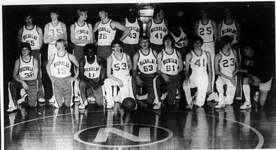
1983-1984 Boys Basketball Bluejackets