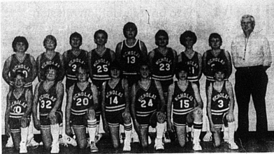
7th grade team