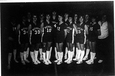
1983-1984 Lady Bluejackets