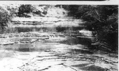
Cassidy Creek still wet Even in the fall of the year Cassidy Creek has water, although not a great amount. But it did make an interesting scene just off the old wooden bridge where Louest Green comes out on Cassidy Road.

POSTED: All persons are hereby notified not to trespass, fish, hunt, trap, shoot upon the land of the undersigned. Any person caught trespassing in violation of this notice will be reported to the Sheriff and prosecuted to the fullest extent of the law.