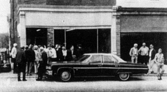
Senior Citizens gathered

County Maps, Drawer 575, Frankfort, KY 40601. Allow $1.00 per copy.