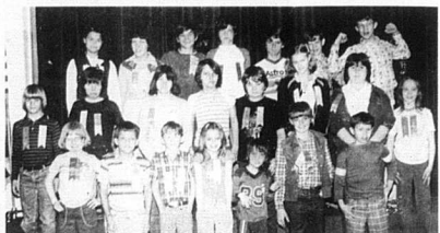
Nicholas County Special Olympics winners