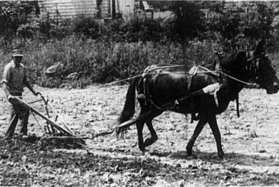
Not all the mules have disappeared

City Council has set a cutoff date for delinquent gas and water customers. The ordinance states that a decision by the board must be rendered within 30 days. Gas, water bills.