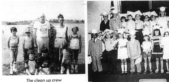
The clean up crew