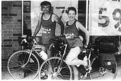
Long distance bike travelers

115th year, No. 28 Carlisle, Kentucky 40311, Thursday, July 15, 1982 25 cents per copy