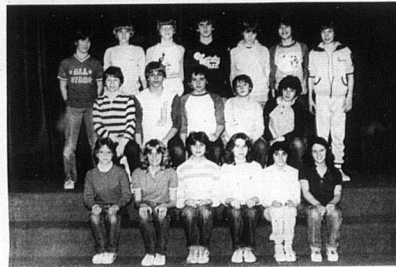
Seventh grade Jackets