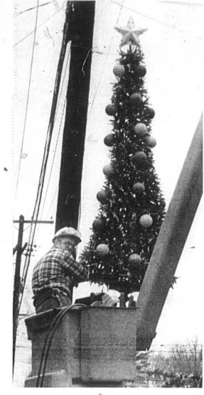
The Christmas season

Newspapers & Microtext Library of Ky. Libraries Lexington, KY 40505