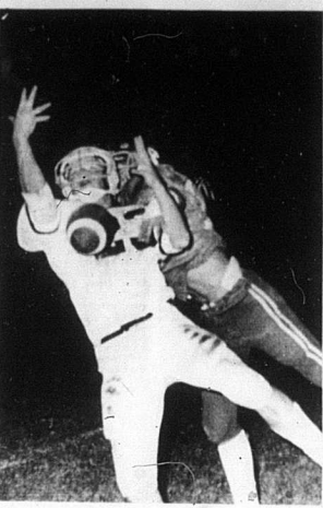
Batting down pass