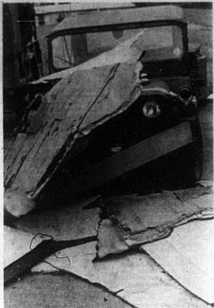
Armory damaged A section of what was once the roof of the National Guard Armory wound up across this jeep after Sunday's violent thunderstorms tore through the county.