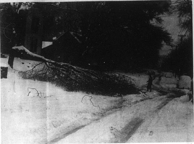
This is the big one