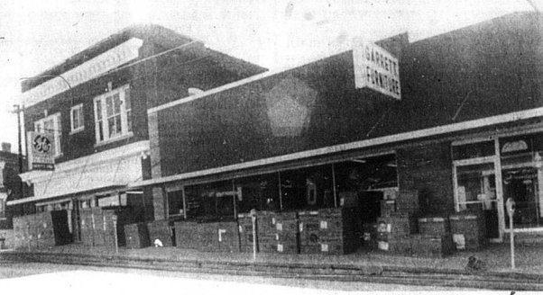
Arrival of G.E. truckload of appliances in front of Garrett's store on West Main St.