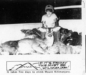
It takes five days to climb Mount Kilimanjaro.