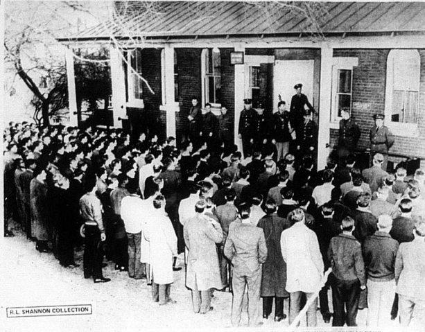
P.L. SHANNON COLLECTION