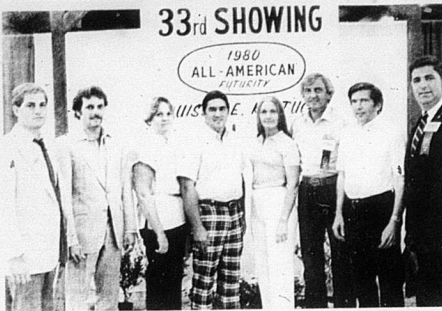
33rd SHOWING ALL-AMERICAN FUTURITY