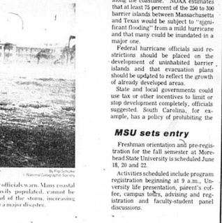
MSU sets entry Freshman orientation and pre-registration for the fall semester at Morehead State University is scheduled June 18, 20 and 21.