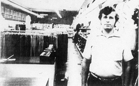
New manager Lerman's gets new manager