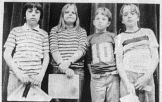
Fourth thru sixth grade winners