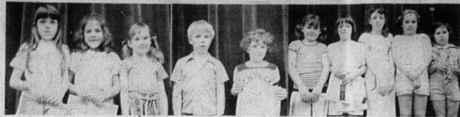
Kindergarten thru third grade science fair winners