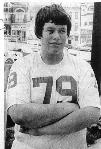
Stained glass pro