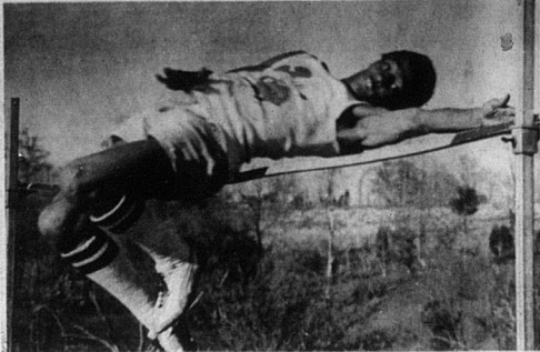
I can do it!

The Ladies Auxiliary to VFW will have a 10th district meeting Sunday, May 7 at 2 p.m. at the VFW post on Walnut Street. The VFW and Auxiliary will install officers for the coming year on Saturday, May 6 at 7 p.m. There will be a potluck supper and dance after the installation.