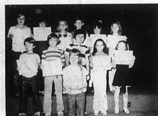
Young bee winners