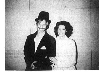
'The Four Poster'