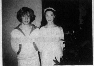
'The Diary of Adam and Eve'

DEPOSIT BANK OF CARLISLE, KY. Established 1886 Our Second Century of Dependable and Dignified Service Phone 289-2205 Member Federal Deposit Insurance Corporation $40,000 Maximum Insurance for Each Depositor