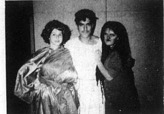
'Androcles and The Lion'