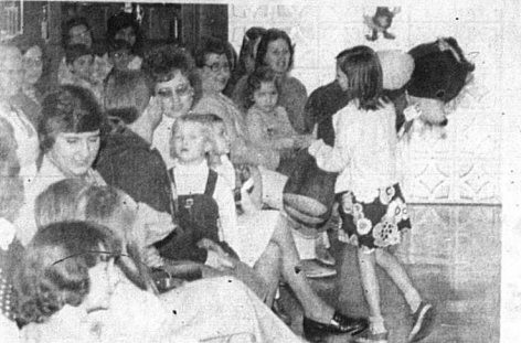
Cafeteria full Parents and grandparents enjoy watching the 215 participants in the annual Easter Egg Hunt held Sunday for children, age three to ten of employees of Blue Grass Industries and Blue Grass Knitting.