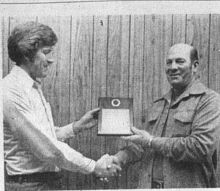
Chamber award given