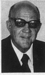
Selected Morticians, and was a licensed Emergency Medical Technician.

chairman of the local Kentucky Heart Fund Memorial, and past chairman of the local Salvation Army for 15 years. He received the Carlisle Jaycee Distinguished Service Award in 1972 and was given an Honorary Life membership by the local Jaycees. He was a member of the National