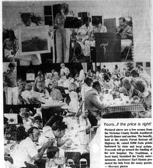
Pictured above are a few scenes from the Nicholas County Health Auxiliary's benefit dinner and auction.

And, spread the word. Fleming-Mason Rural Electric Cooperative, Flemingburg, Kentucky