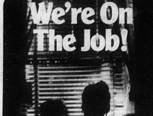
We're On The Job!