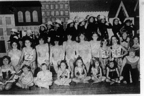
'Small town U.S.A.' revue