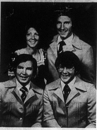
Quartet to sing at church