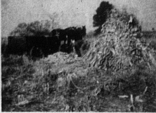
The easy way

Herbert "Hard Times" Higginbotham reported no flat tires and a few gas bill. Higginbotham used this method while growing up in McCreary County, years of custom corn picking