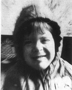
What-cha trying to do to me Daddy-O!