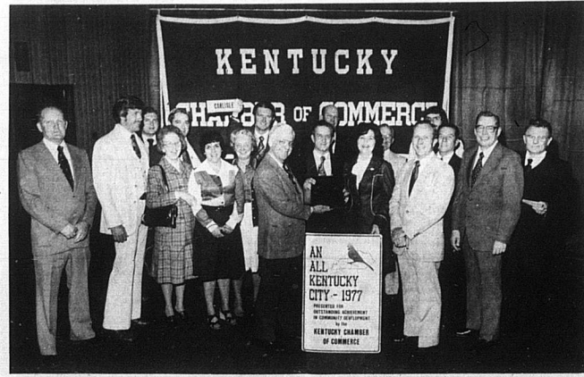
It's hard to be two places at once!