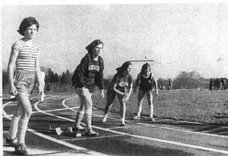
Girls from Nicholas, Clark, and Harrison Counties waited in anxious anticipation for the go-ahead from the coach to begin the 100-yard dash. Nicholas girls lost this meet to Harrison.