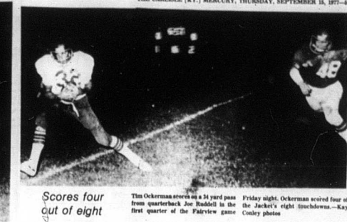
Scores four out of eight