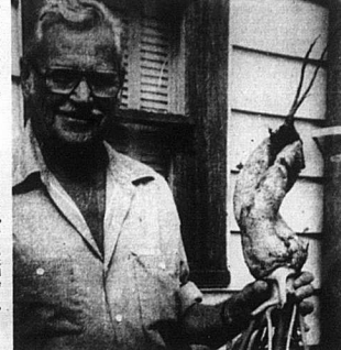
What is it?