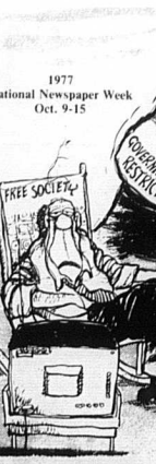
THE MILWAUKEE JOURNAL

'Don't involve me in your petty bickering!'