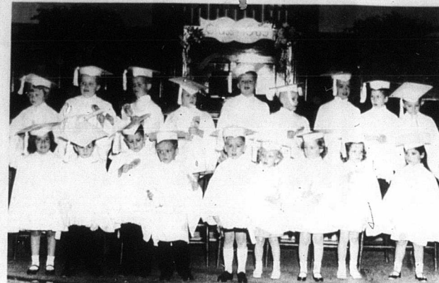
Our graduates of 1977