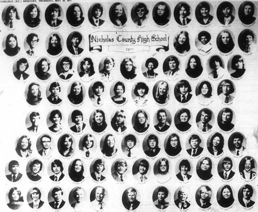
Nicholas County High School 1977