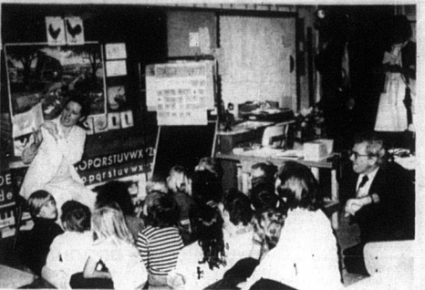
SPECIAL VISITOR—Dr. Ernest L. Boyer (left) with Dr. Ernest L. Boyer (center) and a student teacher reads a story. The commissioner recently toured the school.

Education Commissioner visits Lexington FRANKFORT—The newly-appointed U.S. Commissioner of Education, Dr. Ernest L. Boyer, urged school administrators to maintain close communications with teachers and children in the classrooms during a visit to Kentucky in late April. On his first visit to Lexington, D.C. since his appointment on April 1, Dr. Boyer took time to tour a Lexington elementary school and chat with students there. "I am here to spend time in the school and be with children," Dr. Boyer told reporters at a press conference during his tour of Breckridge. "I want to stay in close touch with school people and the classrooms." During his two-day stay in Kentucky, Dr. Boyer emphasized his belief in local control of schools. "I recognize the importance of having schools remain close to the parents, close to the children," he said. An head of the U.S. Office of Education (USOE), Dr. Boyer feels that federal money should be used to enhance local programs. "I believe in control at the local level, coordination at the state level, and enforcement at the federal level," Dr. Boyer said during a luncheon speech at the Southeastern Conference for School Finance Equalization. Tell It All! Tell It Well! Thank The Easy Way to Sell!—303-2464.