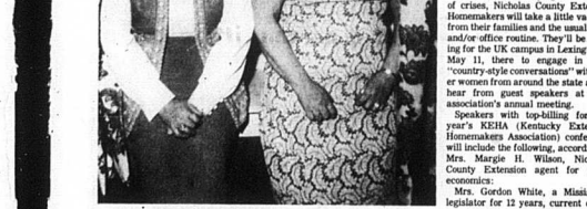
New officers installed

As the third graders watched, he magically turned mounds of gray clay into a flower pot, a jar, a lid for the jar and a plate. But, he didn't quite leave them from the finance company that they are coming after my car.