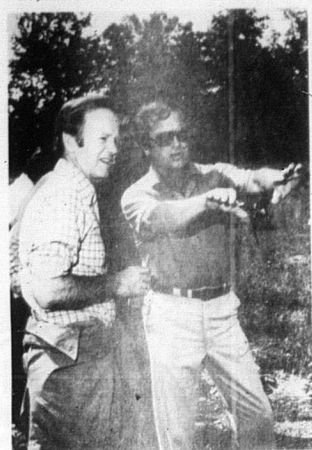
During stripmine tour

HAZARD—Maintaining that coal is the answer to the nation's energy problems, U.S. Transportation Secretary Brock Adams said today that a federal coal transportation task force on a tour of Eastern Kentucky's coal-mining areas this week said "The president has faced up to the fact that, all of a sudden, the days of free and cheap energy are over. Our task now is to make the shift from oil-produced energy to coal-produced energy and to ensure that the nation has sufficient coal transportation capacity to meet new energy needs," Adams said.