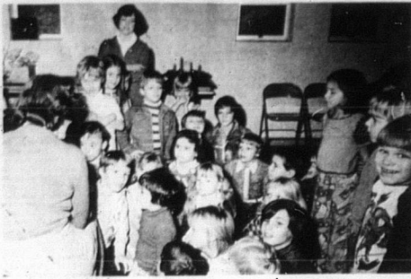
Christmas dinner held