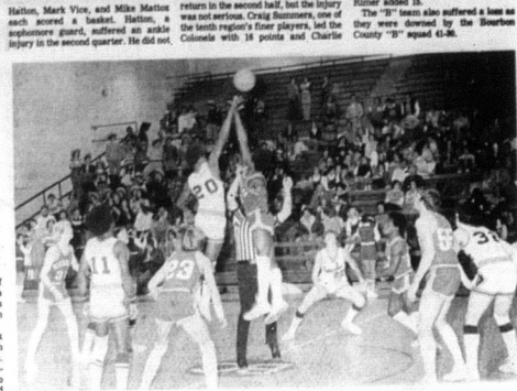
The tipoff of the Nicholas County-Bourbon County game Friday began the game in which Nicholas was destined to suffer defeat at the hands of their neighbors.