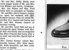
Blue, Tan, White