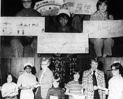
Poster Contest winners named

per pound in 1975. The ASCS chief explained that if prices happen to fall below the target level, the difference would be made up by the Government. "And this is literally average prices paid to farmers during a particular year. We don't foresee this happening, but that is the concept," he said.